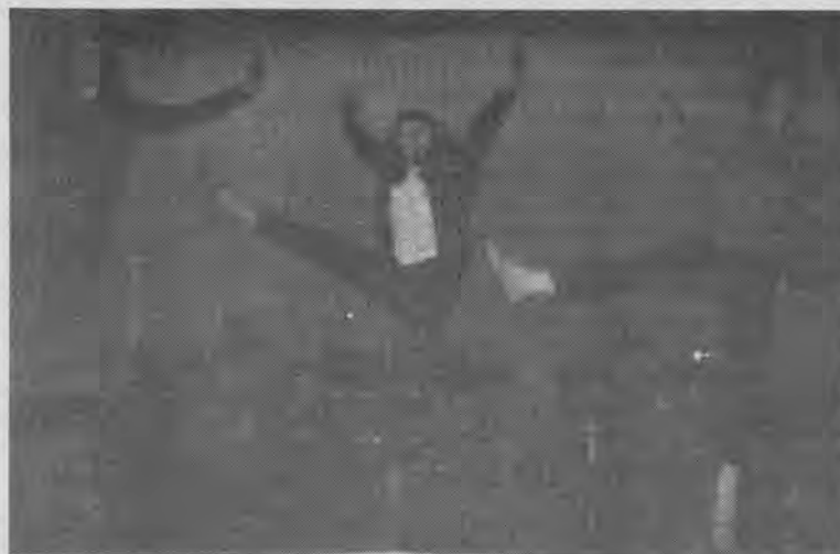
Here we find three girls preparing their dance routine for the upcoming Talent Show.

Students will eat dinner on the way home and return to LaSalle at about 8:30 in the evening.