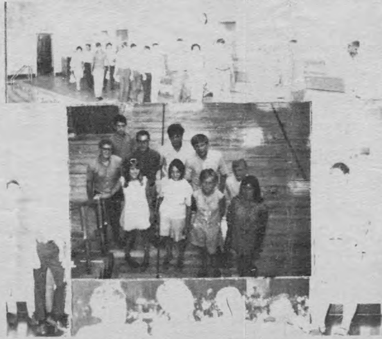
Where's room 401? Are you sure the pool is on the second floor? Is there really an elevator? Never fear freshmen the EXPLORER staff has made a map of LaSalle just for you. See Page 2.

HAPPINESS IS HAVING THE NEXT ISSUE OF THE EXPLORER