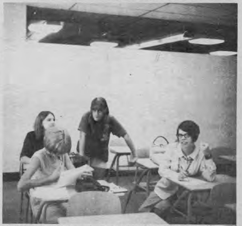
"Here's a behind the scenes look at the EXPLORER STAFF preparing this issue. For story see page two."

will also be more information on all these organizations in future issues of the EXPLORER.