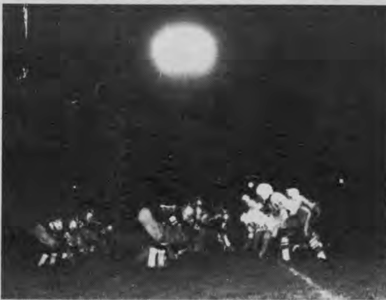
LHS Gridders line up against Clay as the lions fell 13-6.

Now the wheel is blue-scarlet-blue and will be up for grabs Friday, October 11, when our Lions meet Jackson's Tigers in the fourth annual football rivalry.