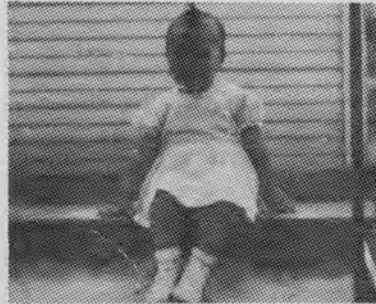
PLACE THE FACE!! The cute little doll in the sandbox is a prominent L.S. senior. She's in the Booster Club, and is a varsity cheerleader--- really goes on "Hey Lions, you look so good to me." You can find her name in the Ads. *