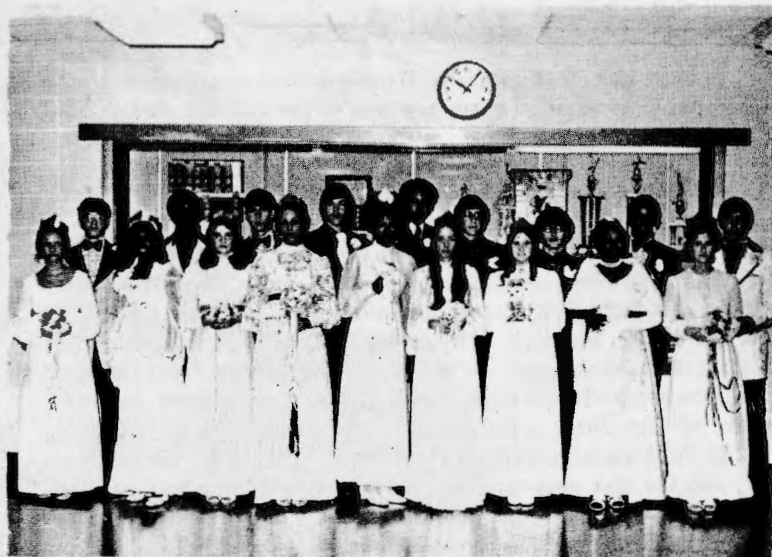
The 1972 Junior Prom court: