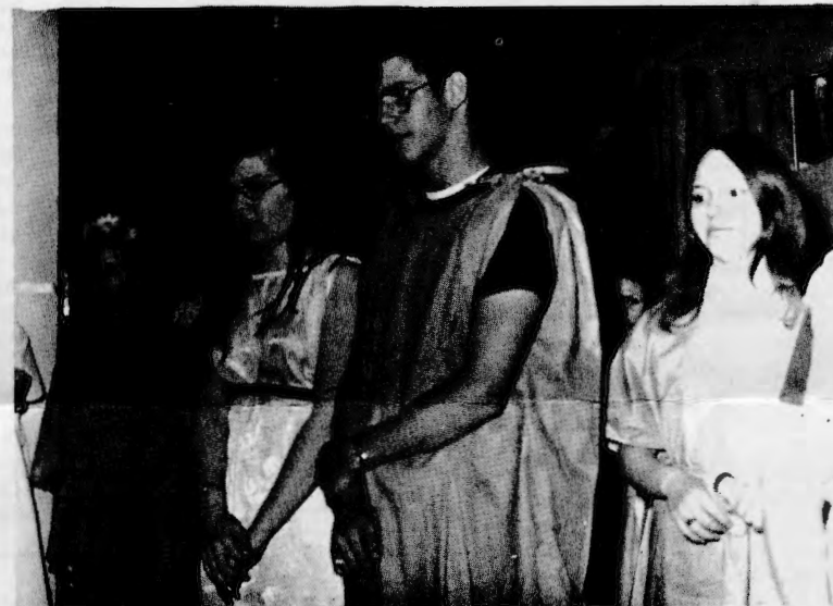
A group of be-togad Latin students stand in awe of Roman banquet ceremony.

Romans, "you'll know that they are probably talking about the Latin Clubs annual Roman banquet.