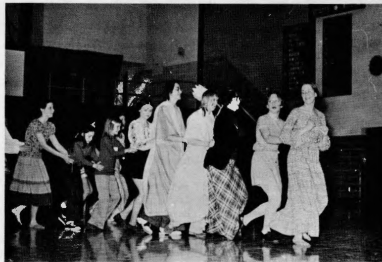
Dancers combine their talents to portray customs of different lands as their portion of the entertainment at LaSalle's Ethnic Festival. The program, held February 17, was a cultural first at LaSalle.